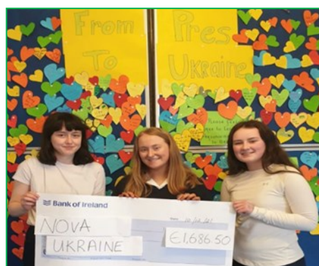
Students from Presentation Secondary School, Kilkenny