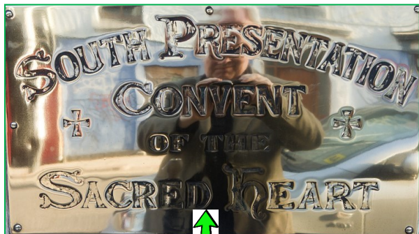
Walk around Nano Nagle Place with the virtual architecture tour (3 min).