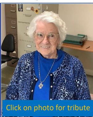
Click on photo for tribute