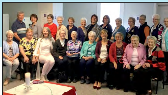
Presentation Associates and Sisters at The Universal Christ Retreat