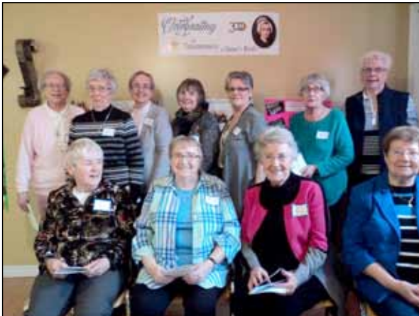
Sisters & Associates from Central NL attend Retreat