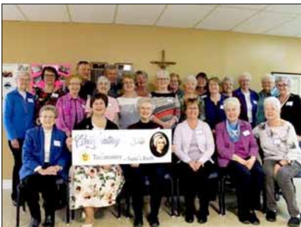
Sisters & Associates from Western NL attend Retreat