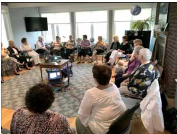
Sisters & Associates from Eastern NL attend Retreat