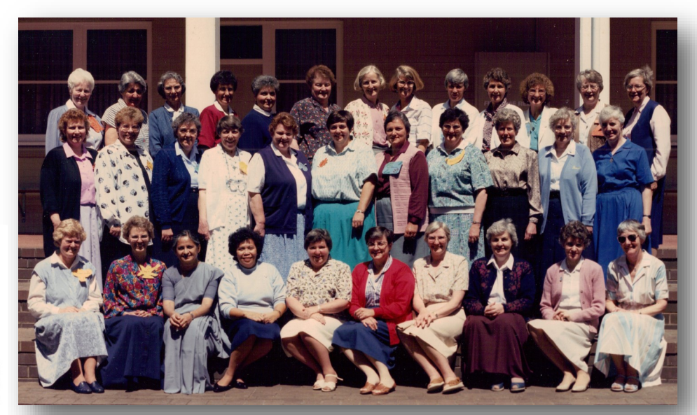
International Presentation Assembly, Perth, Australia, 1991

The evolving nature of IPA is revealed in the themes and logos of the six IPA Assemblies: