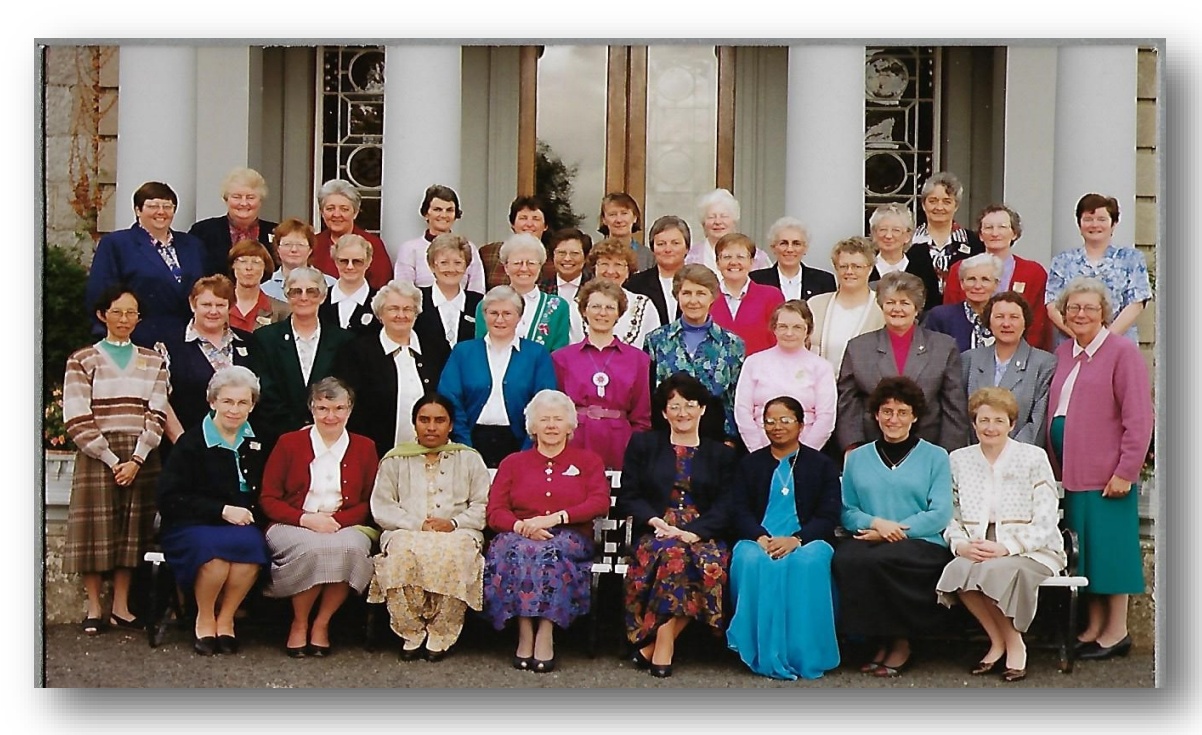
International Presentation Assembly, Portarlington, Ireland, 1995

After the 1989 Assembly a Presentation Network for Justice was established when each Congregation/Province appointed a Justice Contact.