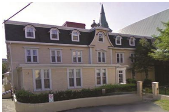
St. Patrick's Convent 2016

We gather here today to celebrate the story of the relationship between the people of St. Patrick's Parish and the Presentation Sisters for the past one hundred and sixty years. We honor the weaving of our lives together as a small, but also significant part of God's unfolding dream and we express our deep gratitude to God and to each other for the blessings we have known throughout the years.